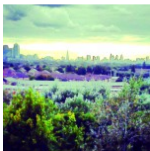
London's skyline.